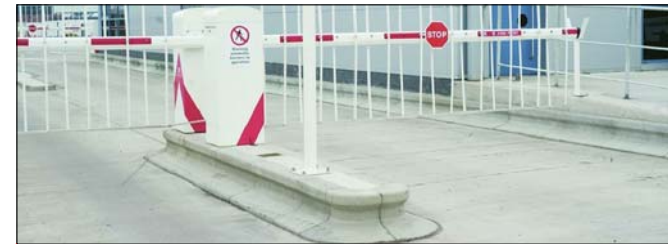
HIGH CONTAINMENT CURB 1500MM FROM EDGE