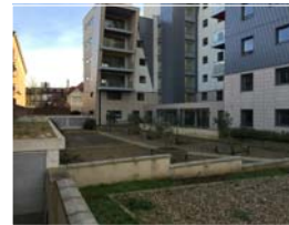
Existing rear landscape